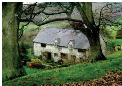
16th century Brithdir Mawr is one of the oldest houses in the area. It was used as a location for the film 'Hilary and Jackie', about cellist Jacqueline Dupre.

5. Troi i'r dde ar y lôn yma ac ymlaen gan fynd heibio Alyn Kennels ar y llaw dde. Drwy'r giât mochyn sy'r tu ôl i'r cenel a dilyn y llwybr yn ôl i Barc Gwledig Loggerheads. Anwybyddu'r bont sydd ar y dde gan ddilyn y llwybr a gan gadw'r afon ar eich llaw dde. Croesi pont garreg a cherdded yn ôl i'r Ganolfan Cefn Gwlad a'r Maes Parcio.