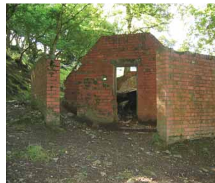
Remains of a WWII aeroplane decoy centre Olion canolfan denu awyrennau o'r Ail Ryfel Byd

5. Turn R on lane and continue ahead passing Alyn Kennels on R. Thro' KG behind kennels and follow path back into Loggerheads Country Park. Ignore footbridge on R and continue along path with river on R. Cross over stone bridge and walk back to Countryside Centre and car park.